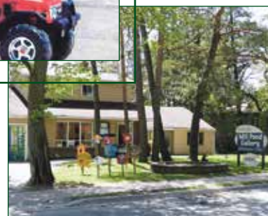
Oak Ridges Community Centre